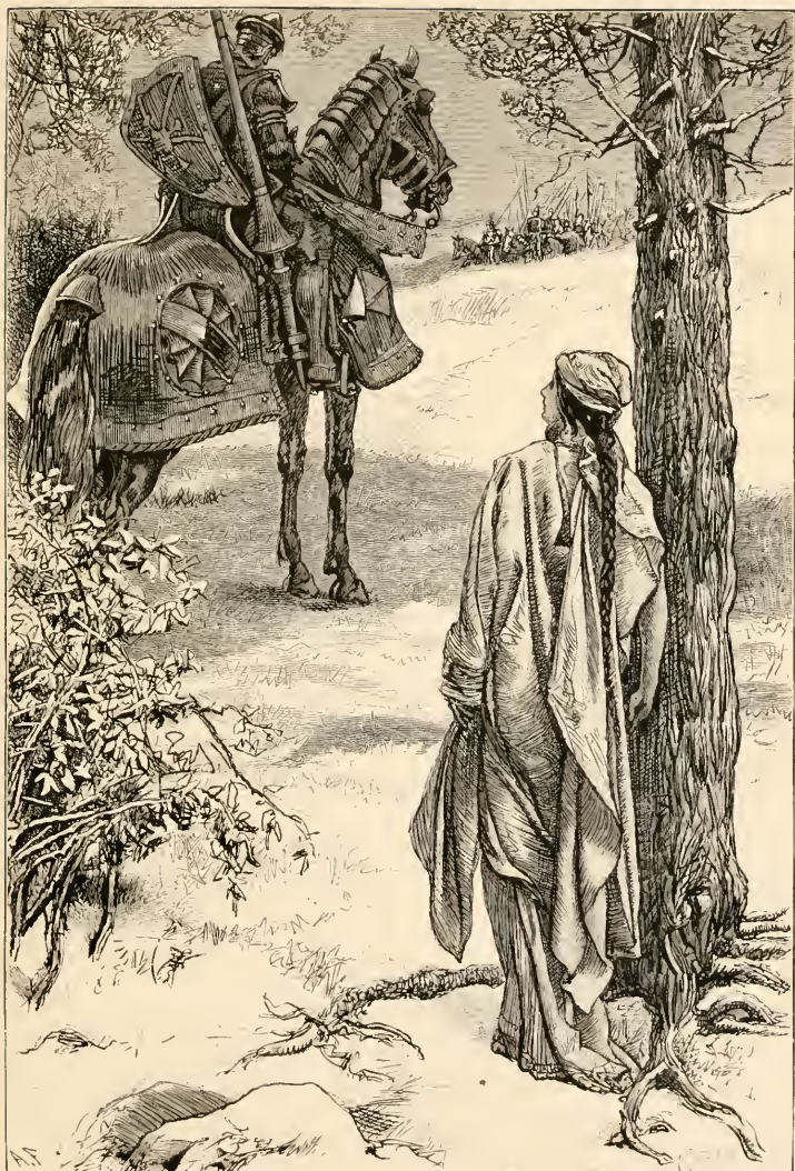
Geraint and the Maiden at the Edge of the Wood.